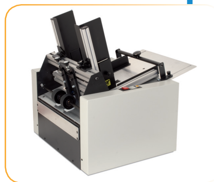
FD 280-10 Heavy Duty Feeder