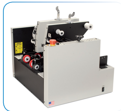
FD 280 Double-Head Edge Tabber