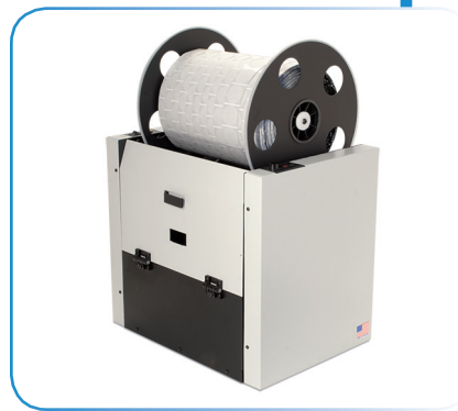
FD 280-20 High Volume Tab Delivery Module